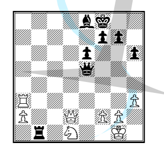
Black to play (see page 2)

Leko (2739) – Bologan (2650) Dortmund (4), 03.08.2003